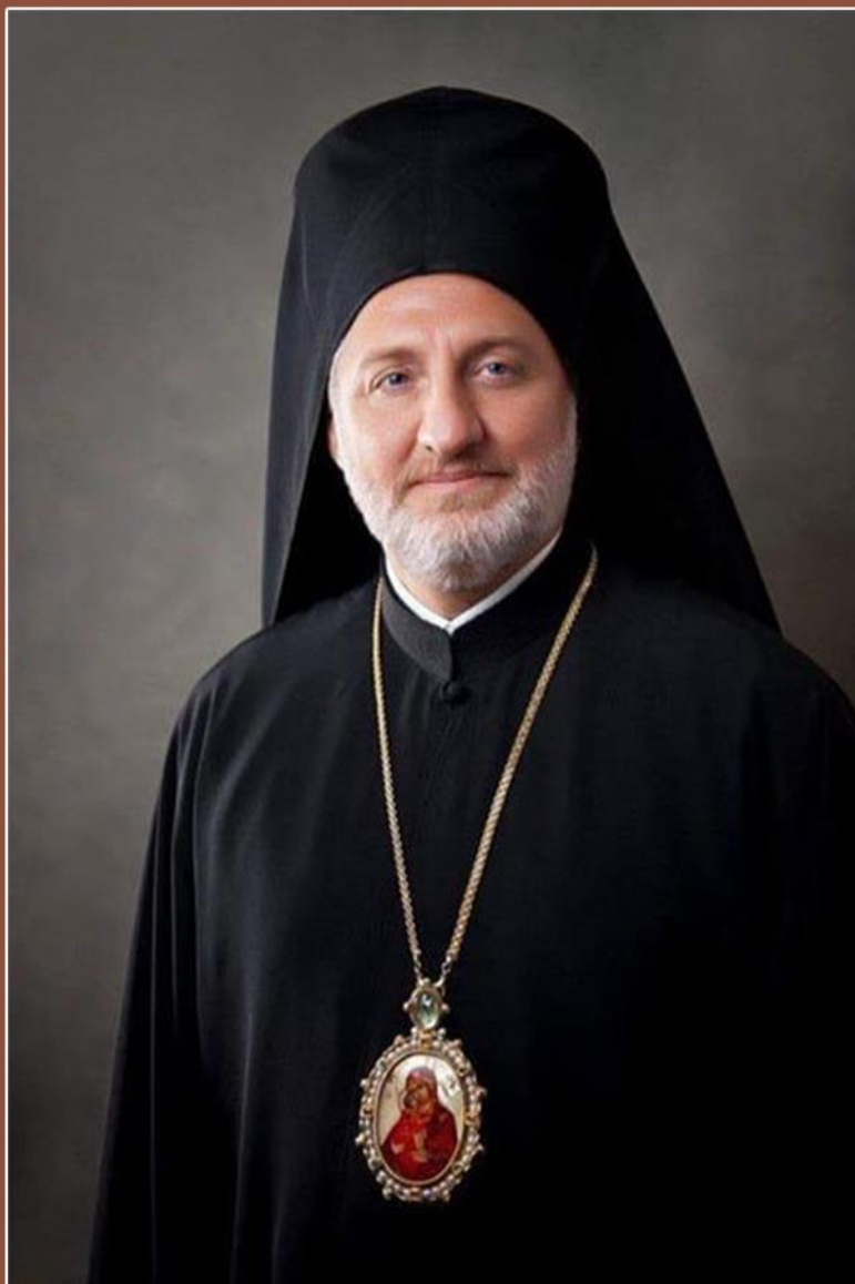
His Eminence Archbishop Elpidophoros of America